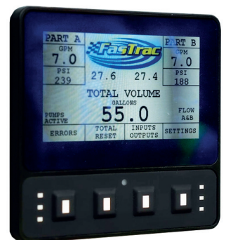
Monitors and Displays Flow Rates for Each Component

For more information on these or any FasTrac products, contact your distributor or the FasTrac Rep for your area.