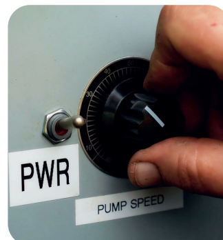
Adjustable Flow Rate